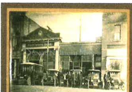
Albany Mail Carriers 1921

View our artifacts, souvenirs and more at City Hall – 400 Railroad Ave., Albany. Call 320-845-4244 to request access.